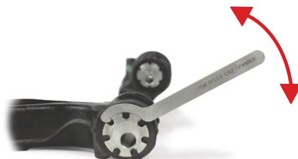
Figure 2 - Adjusting the Geometry